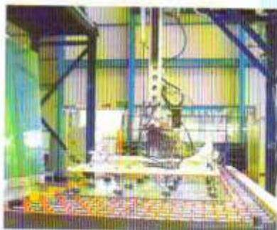
In Process Glass Sheet Handling