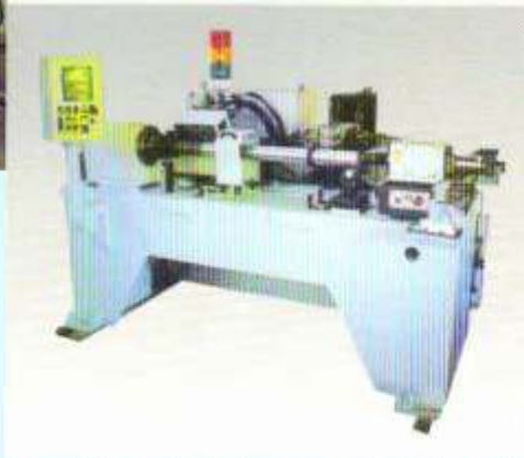
SPM for submersible pump casing