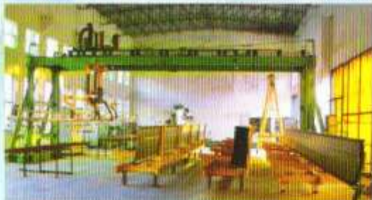
ESP Electrode Handling