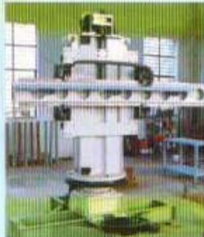
In process Handling-undercarriage wheel