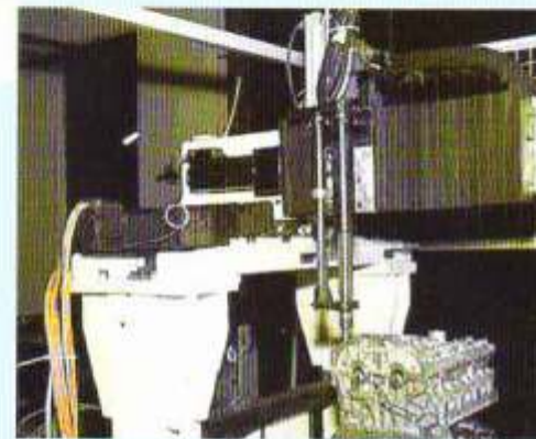
Nut Runner System