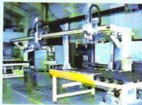
In Process Glass Handling