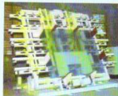
Auto - Packer