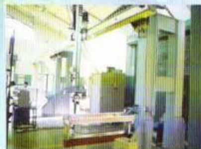
Crank Shaft Handling in Machining Line