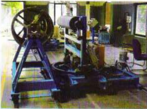
Quick Drum change System